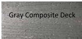
Gray Composite Deck