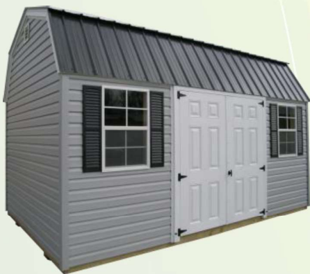
Vinyl Lofted Garden