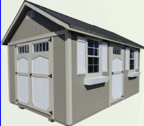
Deluxe Garden Shed With Roof Overhang