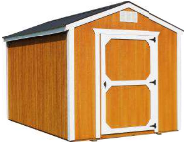
8ft wide with single door.