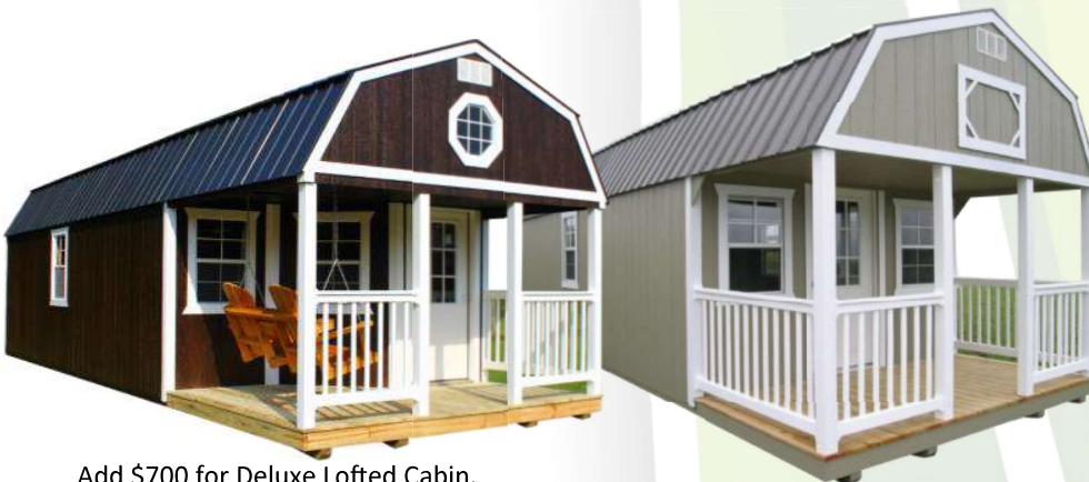
Add $700 for Deluxe Lofted Cabin. Includes 5ft swing and octagon loft window

6'6" Wall Height. Choice of 4ft or 6ft Porch.