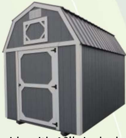
8ft wide with 46" single door.