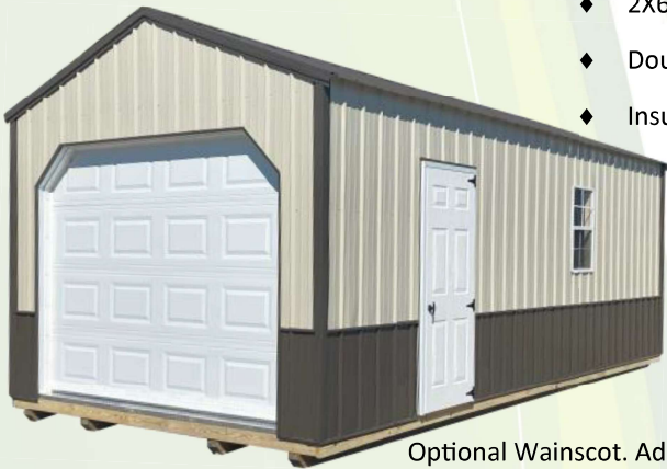
Optional Wainscot. Add $150.00