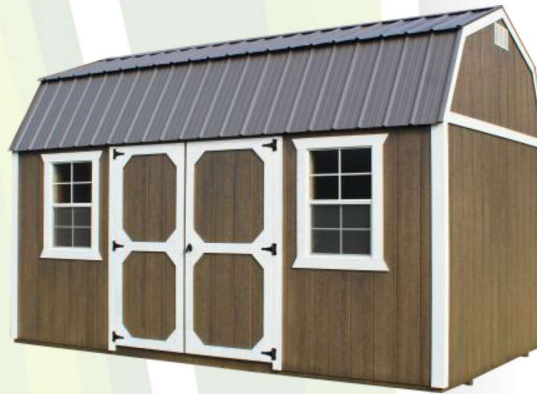
Painted Lofted Garden