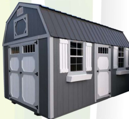
Deluxe Lofted Garden Shed