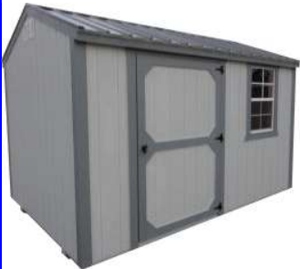
8ft wide with single door.